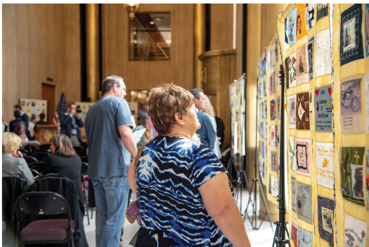
The LifeSource Donor Family Quilts is a patchwork of memories, lovingly created by donor family members throughout the Upper Midwest as a tribute to those who have shared the gift of life.

LifeSource's care for donors and their families begins with our first interaction and extends through our comprehensive aftercare program. Our Donor Family Advocates help families navigate their grief journey and honor their loved ones' legacy. They provide resources to