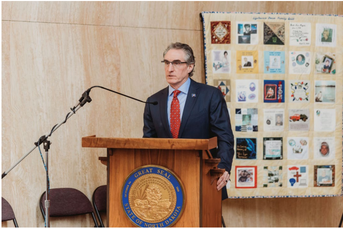
Governor Doug Burgum honored the families of organ, eye and tissue donors in a special recognition ceremony.

families and are available to answer questions or simply to listen. In addition to the many programs they provide, they also host a Private Donor Family Facebook Group, so families can connect with one another in a time and space that is comfortable.